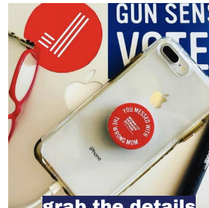
grab the details