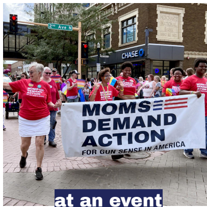
at an event