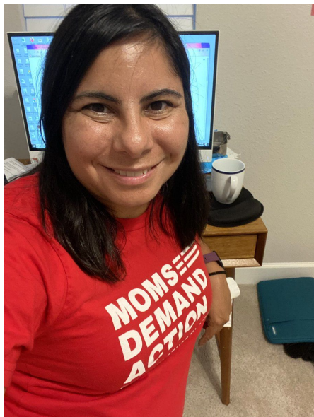
Take a Quick Selfie!